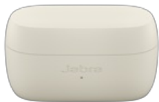
Jabra Elite 3 - Light Beige