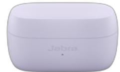
Jabra Elite 3 - Lilac