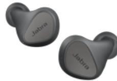
Jabra Elite 3 - Dark Grey