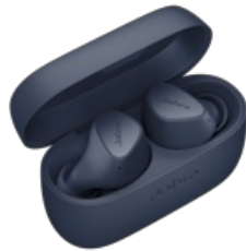
Jabra Elite 3 - Navy