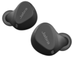
Jabra Elite 3 Active