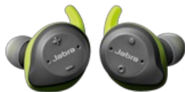
Jabra Elite Sport (Lime Green Grey)