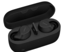
Jabra Evolve2 Buds - USB-A MS