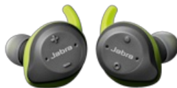
Jabra Elite Sport (Lime Green Grey)