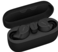
Jabra Evolve2 Buds - USB-C UC