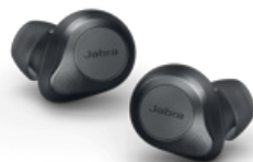
Jabra Elite 85t - Grey