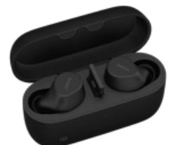
Jabra Evolve2 Buds - USB-A MS