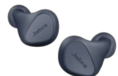
Jabra Elite 3 - Navy