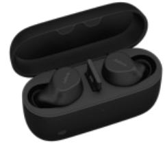
Jabra Evolve2 Buds - USB-A MS