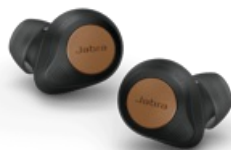
Jabra Elite 85t - Copper Black