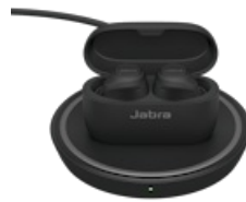
Jabra Elite 75t Wireless Charging -