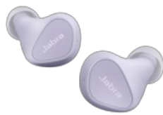
Jabra Elite 3 - Lilac