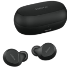
Jabra Elite 7 Sport - Black