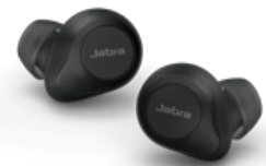
Jabra Elite 85t - Black