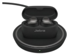
Jabra Elite 75t Wireless Charging -