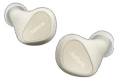
Jabra Elite 3 - Light Beige