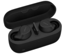
Jabra Evolve2 Buds - USB-A MS