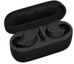
Jabra Evolve2 Buds - USB-A MS