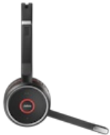
Jabra Evolve 75+ MS Stereo