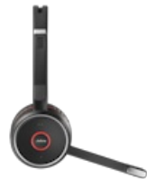
Jabra Evolve 75 MS Stereo