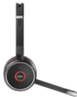
Jabra Evolve 75+ UC Stereo