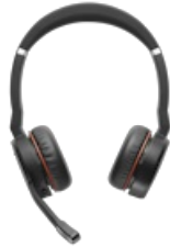
Jabra Evolve 75 SE - UC Stereo with