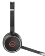
Jabra Evolve 75+ MS Stereo