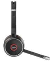
Jabra Evolve 75 SE - MS Stereo