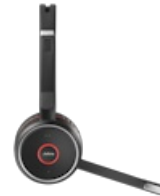
Jabra Evolve 75 MS Stereo