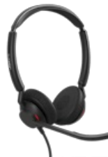
Jabra Engage 50 II - (50 II Link) USB-C/A,