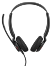
Jabra Engage 50 II - USB-A UC Stereo