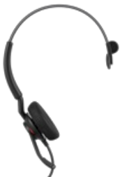
Jabra Engage 40 - (Inline Link) USB-C/A