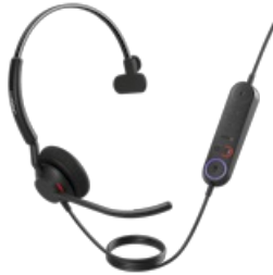
Jabra Engage 40 - (Inline Link) USB-C