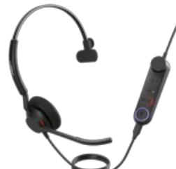
Jabra Engage 50 II - (Engage 50 II Link)