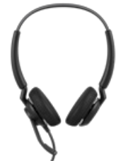
Jabra Engage 40 - (Inline Link) USB-C