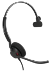
Jabra Engage 50 II - USB-A UC Mono