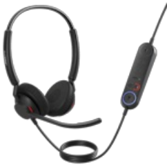
Jabra Engage 40 - (Inline Link) USB-A