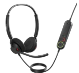
Jabra Engage 40 - (Inline Link) USB-A