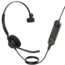
Jabra Engage 50 II - (Engage 50 II Link)