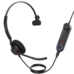
Jabra Engage 50 II - (Engage 50 II Link)