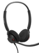
Jabra Engage 40 - (Inline Link) USB-C/A