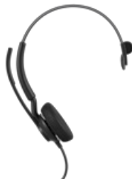
Jabra Engage 40 - (Inline Link) USB-C/A