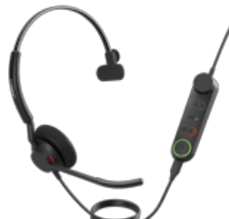
Jabra Engage 50 II - (Engage 50 II Link)