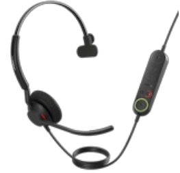
Jabra Engage 40 - (Inline Link) USB-A