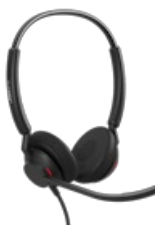
Jabra Engage 40 - USB-C UC Stereo