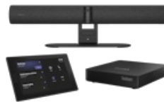
Jabra PanaCast 50 Room System 2 - USB