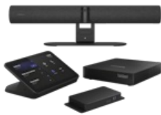
Jabra PanaCast 50 Room System 2 - IP