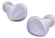
Jabra Elite 3 - Lilac