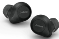
Jabra Elite 85t - Black