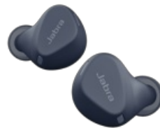
Jabra Elite 4 Active - Navy