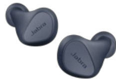
Jabra Elite 3 - Navy