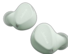
Jabra Elite 4 Active - Mint