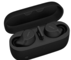
Jabra Evolve2 Buds - USB-A MS