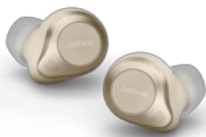
Jabra Elite 85t - Gold Beige