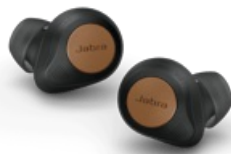
Jabra Elite 85t - Copper Black