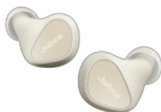
Jabra Elite 3 - Light Beige