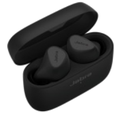
Jabra Connect 5t - Titanium Black