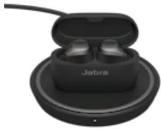
Jabra Elite 75t Wireless Charging -