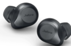
Jabra Elite 85t - Grey