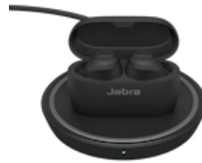
Jabra Elite 75t Wireless Charging -