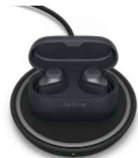
Jabra Elite 85t - Grey with 2 wireless