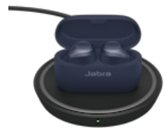
Jabra Elite Active 75t Wireless Charging -