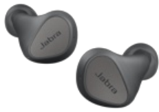
Jabra Elite 3 - Dark Grey