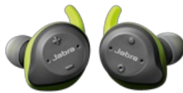
Jabra Elite Sport (Lime Green Grey)