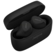
Jabra Elite 5 - Black