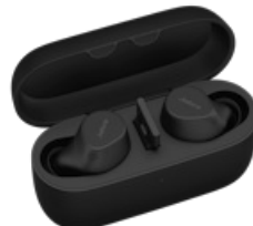
Jabra Evolve2 Buds - USB-A UC