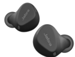
Jabra Elite 3 Active