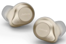
Jabra Elite 85t - Gold Beige