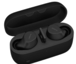
Jabra Evolve2 Buds - USB-A MS