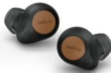
Jabra Elite 85t - Copper Black