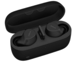
Jabra Evolve2 Buds - USB-A MS