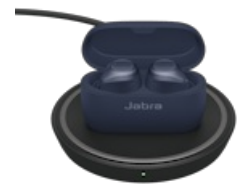
Jabra Elite Active 75t Wireless Charging -