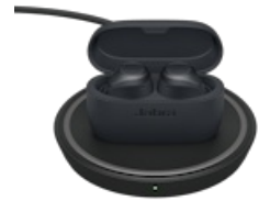
Jabra Elite Active 75t Wireless Charging -