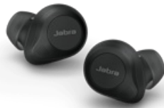
Jabra Elite 85t - Black