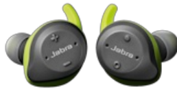
Jabra Elite Sport (Lime Green Grey)