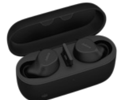
Jabra Evolve2 Buds - USB-A MS