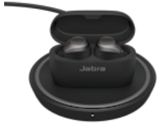
Jabra Elite 75t Wireless Charging -