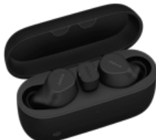
Jabra Evolve2 Buds - USB-C MS