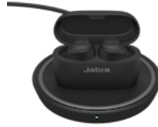
Jabra Elite 75t Wireless Charging -