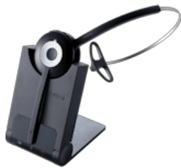
Jabra Pro 920 Mono