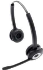
Jabra Pro 920 Duo