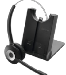
Jabra Pro 925 Dual Connectivity