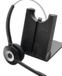
Jabra Pro 925