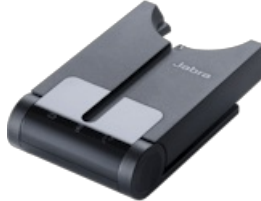
Jabra Pro 930 MS