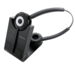
Jabra Pro 930 Duo