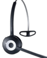
Jabra Pro 930 Mono