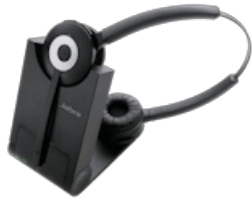
Jabra Pro 930 Duo MS