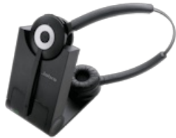
Jabra Pro 930 Duo MS