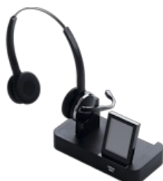
Jabra Pro 9460 Duo