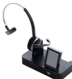
Jabra Pro 9460 Mono