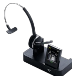
Jabra Pro 9470 Mono