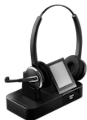
Jabra Pro 9465 Duo