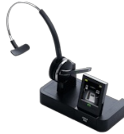
Jabra Pro 9470 Mono