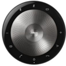
Jabra Speak 710 MS