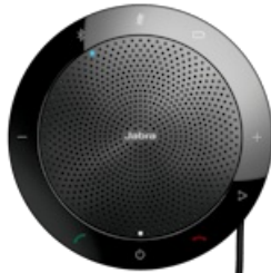
Jabra Speak 510+ MS