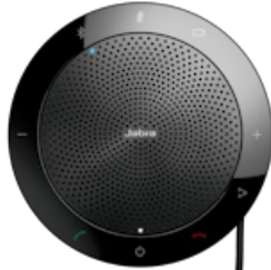
Jabra Speak 510 MS