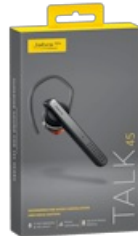
Jabra Talk 45 - Silver