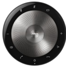
Jabra Speak 710 MS