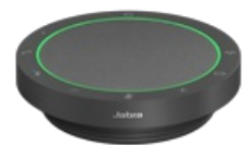
Jabra Speak2 55 UC Dark Grey