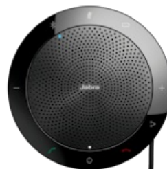
Jabra Speak 510+ MS