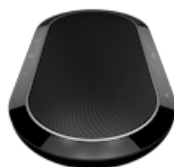
Jabra Speak 810 MS