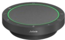
Jabra Speak2 55 MS Teams, Dark Grey