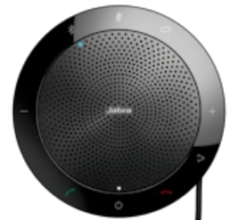
Jabra Speak 510