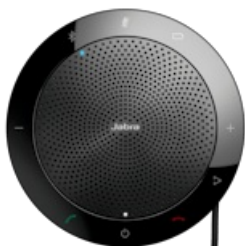
Jabra Speak 510 MS