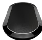
Jabra Speak 810 UC