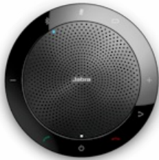
Jabra Connect 4s - USB-A