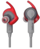
Jabra Sport Coach Wireless