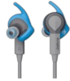
Jabra Sport Coach Wireless