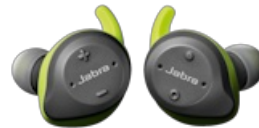
Jabra Elite Sport (Lime Green Grey)