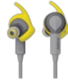
Jabra Sport Coach Wireless