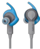
Jabra Sport Coach Wireless