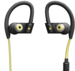
Jabra Sport Pace Wireless Yellow