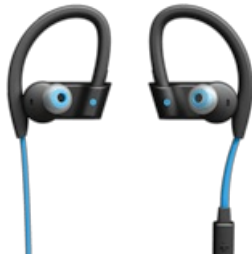
Jabra Sport Pace Refurbished Blue