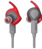
Jabra Sport Coach Wireless