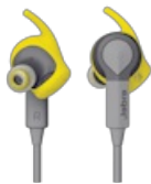
Jabra Sport Coach Wireless