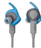
Jabra Sport Coach Special Edition