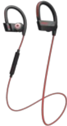
Jabra Sport Pace Wireless Red