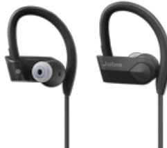
Jabra Sport Pace