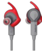
Jabra Sport Coach Wireless