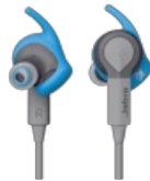
Jabra Sport Coach Wireless