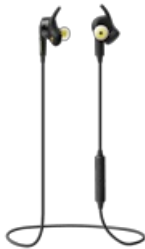
Jabra Sport Pulse Wireless Refurbished