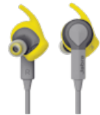
Jabra Sport Coach Wireless