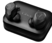
Jabra Elite Sport (Upgrade)