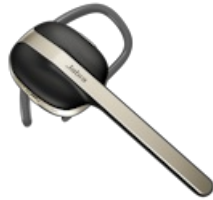
Jabra Talk 30