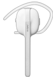
Jabra Style White