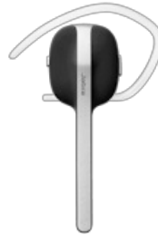
Jabra Style Refurbished