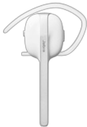
Jabra Style White