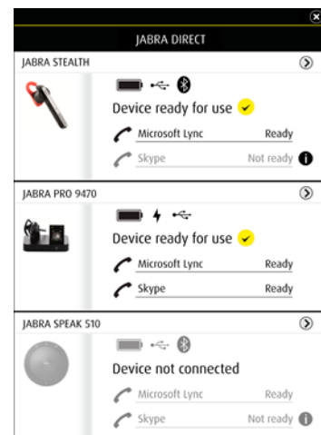
Jabra Direct Dashboard